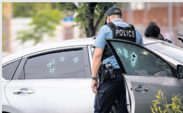
Chicago police investigate in the 700 block of North Spaulding Avenue, where a 40-year-old man was shot multiple times while he was riding in a car on the West Side on Memorial Day, Monday night, May 31, 2021, in Chicago.